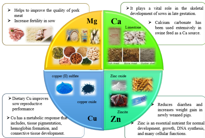
Fig. 1. Health benefits and beneficial application of micro and macro-minerals in non-ruminant.