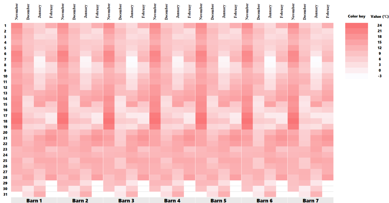
Fig. 1. Heatmap profile showing the daily mean temperature in each barn. Dark red indicates the maximum daily mean temperature and white indicates the minimum mean temperature. The values are expressed in degree celsius.