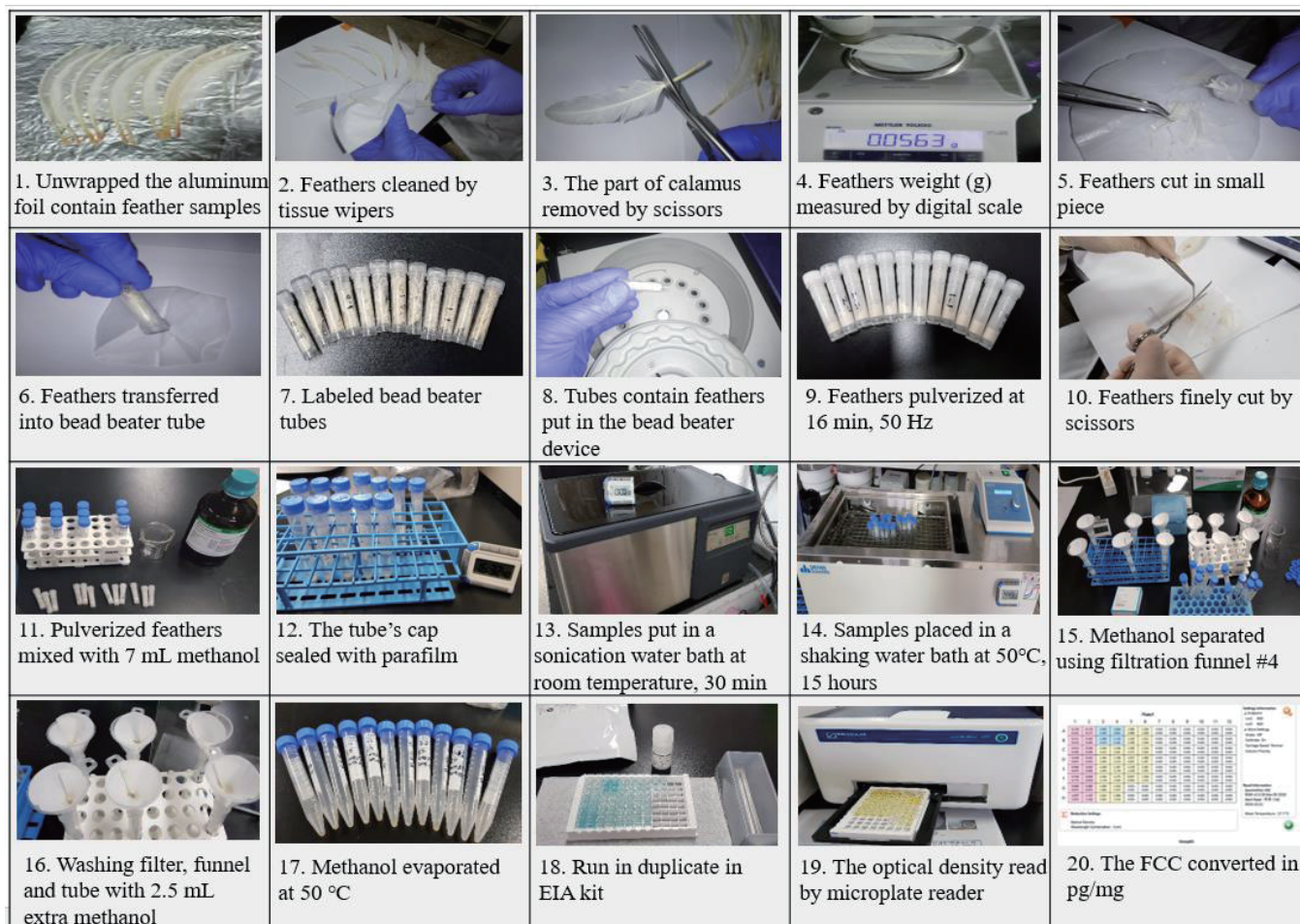
Fig. 1. Infographic of feather corticosterone analysis methodology. FCC, feather corticosterone concentration.

Seoul, Korea) and the tube's cap was sealed with parafilm and inserted in a sonication water bath at room temperature for 30 minutes. A while later, samples were placed in a shaking water bath (50 °C, 15 hours). Feather samples and methanol was separated using filtration funnel (#4 Whatman filter paper). 2.5 mL extra methanol was used to rinse the filter paper and tubes. This rinsing procedure was repeated and added to the methanol extraction followed by drying in a 50 °C in the incubator to evaporate the methanol. The extract residues were stored in the freezer (-20 °C) for final analysis corticosterone hormone. Prior to use of the EIA kit, the dried hormone extracted of feather samples was thawed at room temperature, then added 0.5 mL of assay diluent buffer provided by the EIA kit (Prod. No. K014-H, Arbor Assay, Ann Arbor, MI, USA), vortex completely, and centrifuged at 1,500×g for 15 minutes, and then each sample duplicated into two wells in order to improve the power of the test and reliability of the results. For duplication, 50 µL of supernatant have chosen based on the kit recommendations. It should be noted that 8 standard solutions were used to draw the data curve. The optical density of samples was read using a microplate reader (SpectraMax Absorbance Readers, Molecular Device LLC, San Jose, CA, USA ) wavelength of 450 nm (Fig. 1). The concentration of corticosterone obtained from the microplate reader was in pg/mL converted to the unit pg/mg.