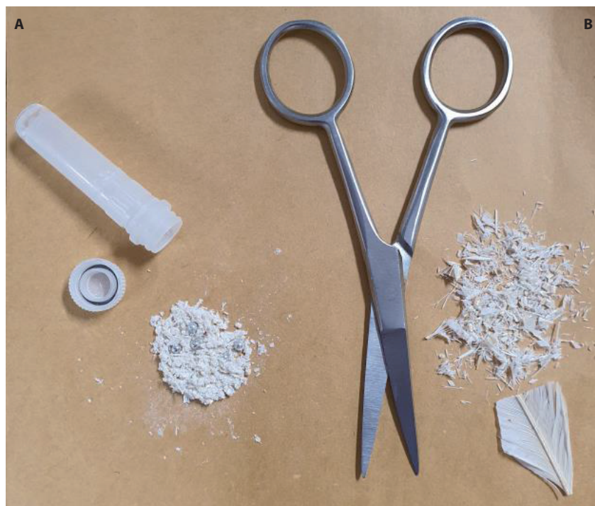
Fig. 4. Feather sample pulverized by the bead beater A versus feather finely chopped by the surgical scissors B.

working step was performed by the SS method and it could increase the chance of contaminations with external sources. In contrast, Slominski et al. [31] concluded that using the SS was a more valid method in hair processing than using Bullet Blender. Given these results, the BB is ideally suited versus the SS for breaking feathers matrix and is recommendable as it produces smaller homogenized particle size prior to hormone extraction.