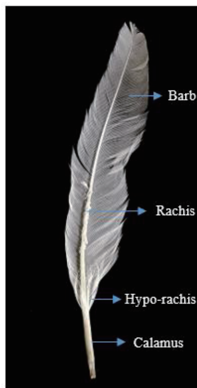
Fig. 2. The main structure of broiler chickens feather.

Blood corticosterone is deposited in the keratin structure at the time of feather growth, however, the level of corticosterone dispositions into feather is influenced by feather growth [4,6,10]. Therefore, choosing the feather processing method prior to corticosterone measurement as a putative biomarker of chronic stress is crucial. It is mainly because the results can vary greatly with respect to performing inappropriate feather preparation prior to corticosterone extraction. With similar