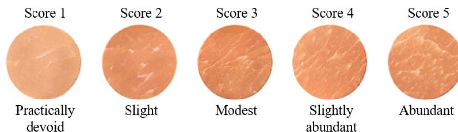
Fig. 2. Korean marbling grading diagram according to intramuscular fat. Adapted from [26] with public domain.

During transport, behaviors were continuously recorded using cameras (Intelbras VMH 1010 D HD 720p, Intelbras SA, São José, Brazil), installed on the ceiling of the trailer. During transport, the number of pigs in each posture (lying, standing, sitting, aggression, and overlap; Table 2) was